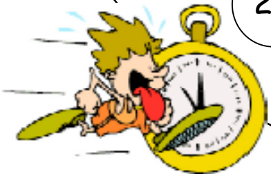
Style 3: Solutionseeker

SOUTH Abstract Conceptualization Left Brain THINKING