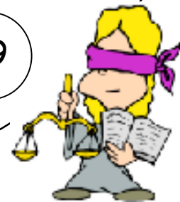
Style 2: Truthkeeper