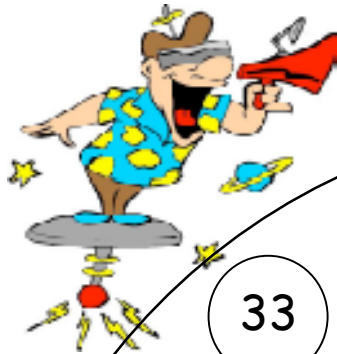
Style 4: Risktaker